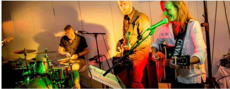
Our band played live for the first time last week

Our band played live for the first time last week. We were all really nervous, but it went pretty well. I think we were all surprised by how much the crowd liked us.