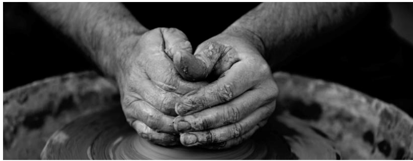
I do pottery at the weekends

You need to think about how to talk about the things you like to do and how to speak for a long time. This is where all the English question words can help you.