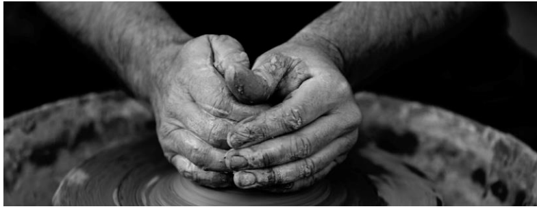
I do pottery at the weekends

You need to think about how to talk about the things you like to do and how to speak for a long time. This is where all the English question words can help you.