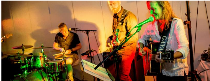
Our band played live for the first time last week

Our band played live for the first time last week. We were all really nervous, but it went pretty well. I think we were all surprised by how much the crowd liked us.