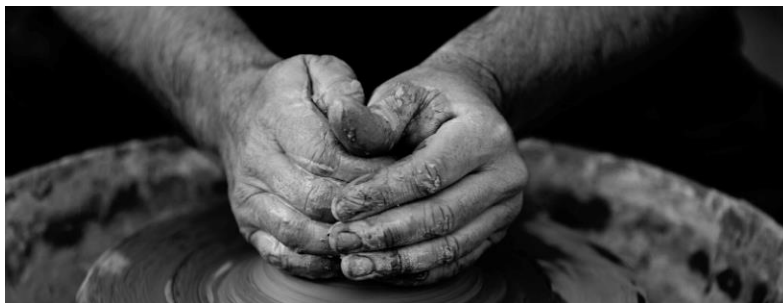
I do pottery at the weekends

You need to think about how to talk about the things you like to do and how to speak for a long time. This is where all the English question words can help you.