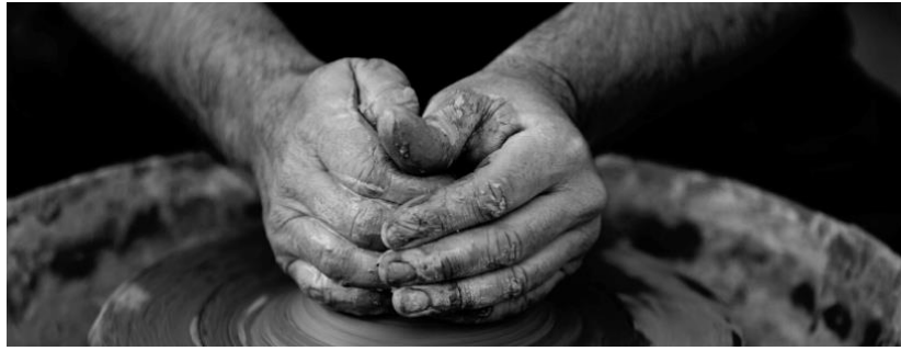
I do pottery at the weekends

You need to think about how to talk about the things you like to do and how to speak for a long time. This is where all the English question words can help you.