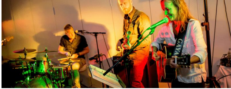
Our band played live for the first time last week

Our band played live for the first time last week. We were all really nervous, but it went pretty well. I think we were all surprised by how much the crowd liked us.